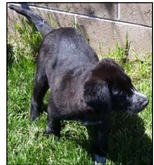
A Labrador pup who had been residing at the NCAS. This little gal, as well as her sister, found new forever homes at the Adoptathon.

YES, I want to help make a difference in the lives of the unwanted animals of Nevada County! Sammie's Friends is a volunteer organization created to raise veterinary funds for the animals at the Nevada County Animal Shelter. Our work with the animals is made possible by the donations of generous individuals in our community. All donations are greatly appreciated, and all monies raised are for the benefit of the animals. Checks may be submitted to the address below, or visit our website at www.sammiesfriends.org and click on the Paypal link for credit or debit cards donations.