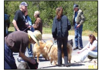
Volunteers, attendees, and canine companions mingle at the Adoptathon.