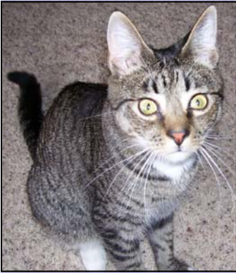
Tater today. Still rather odd looking, but certainly unique and we think very endearing .....