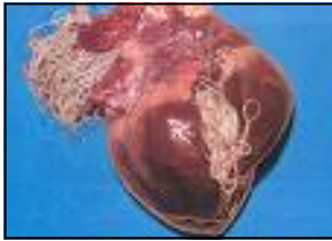
A dog's heart infected with heartworm.

"One reason heartworms are so common in our area is the very high incidence of infection in our resident coyote population"