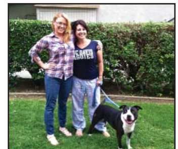
I've met some wonderful humans during my excellent adventure! My question now is, "where are MY pajamas"?

Upon arrival back in L.A., George had to go to a day care center because his rescue foster home had been given to some other dog in his absence. What a shame! Tsk Tsk! George gets to play with other dogs all day long. I would say George's trip up this way was well worth it.