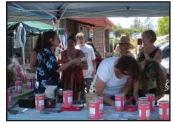
The raffle table, a chance to win a great donated item!