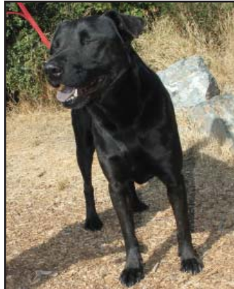
My pal's at home in New Mexico, so I'm doing the photo op 'cause we look so much alike!

One day, in June, a man brought a cute little lab to the shelter saying that he had found her in his neighborhood and had asked around and no one seemed to claim her. He was sad that he was unable